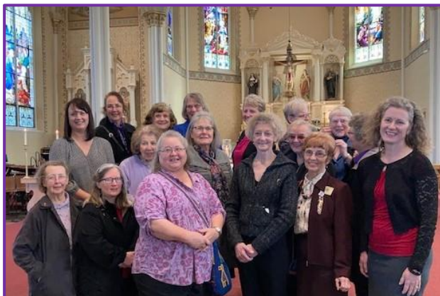
Members of Court Marion #718